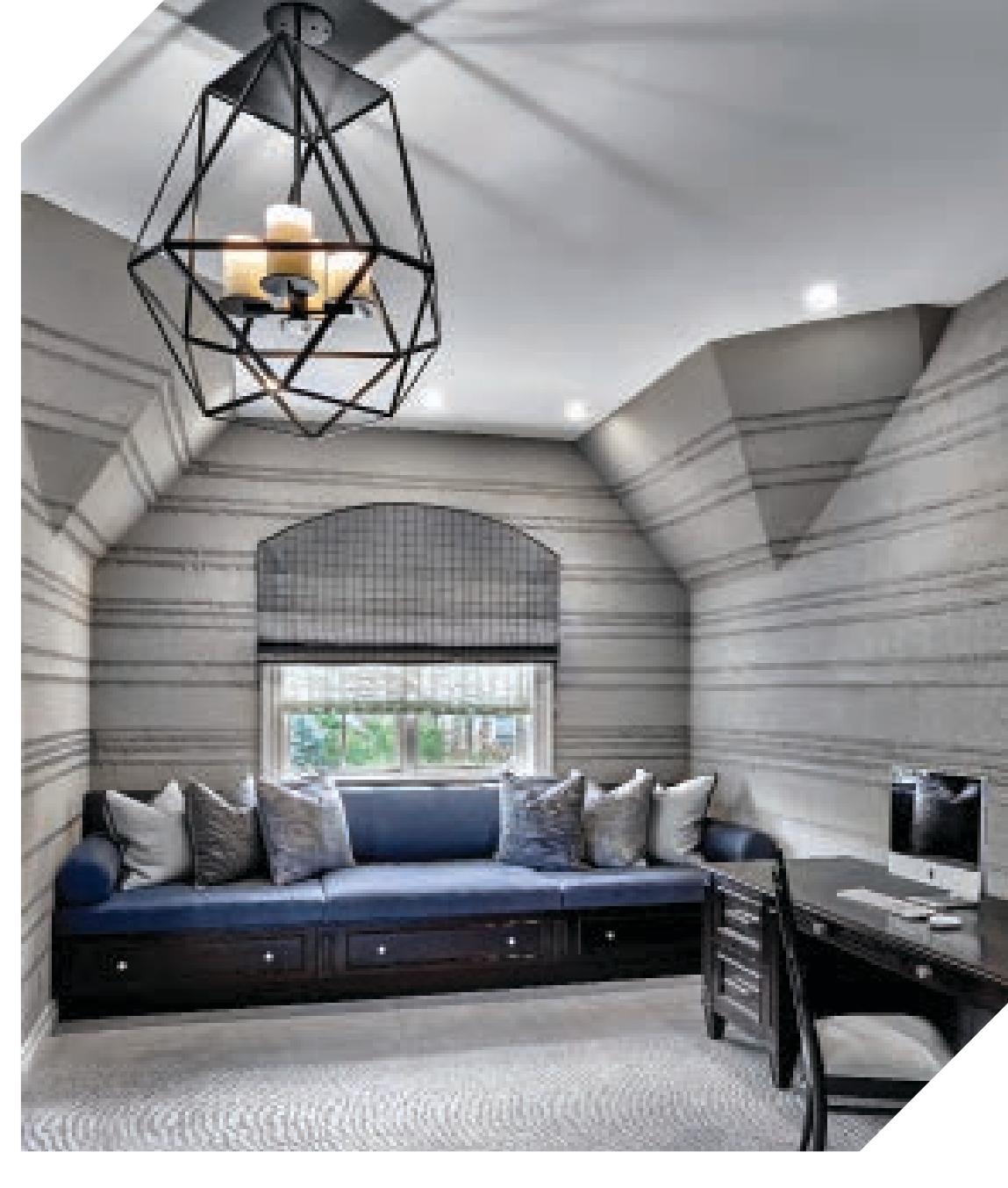
GRAY MATTER The home office is a study in grays, with a punch of rich navy blue to continue the home's subtle nautical theme. The desk and built-in bench seat are custom designs by Coburn, made of cerused walnut and fabricated by Vas Design. The burlap wallcovering was hand-done by Anna Wolfson on-site.