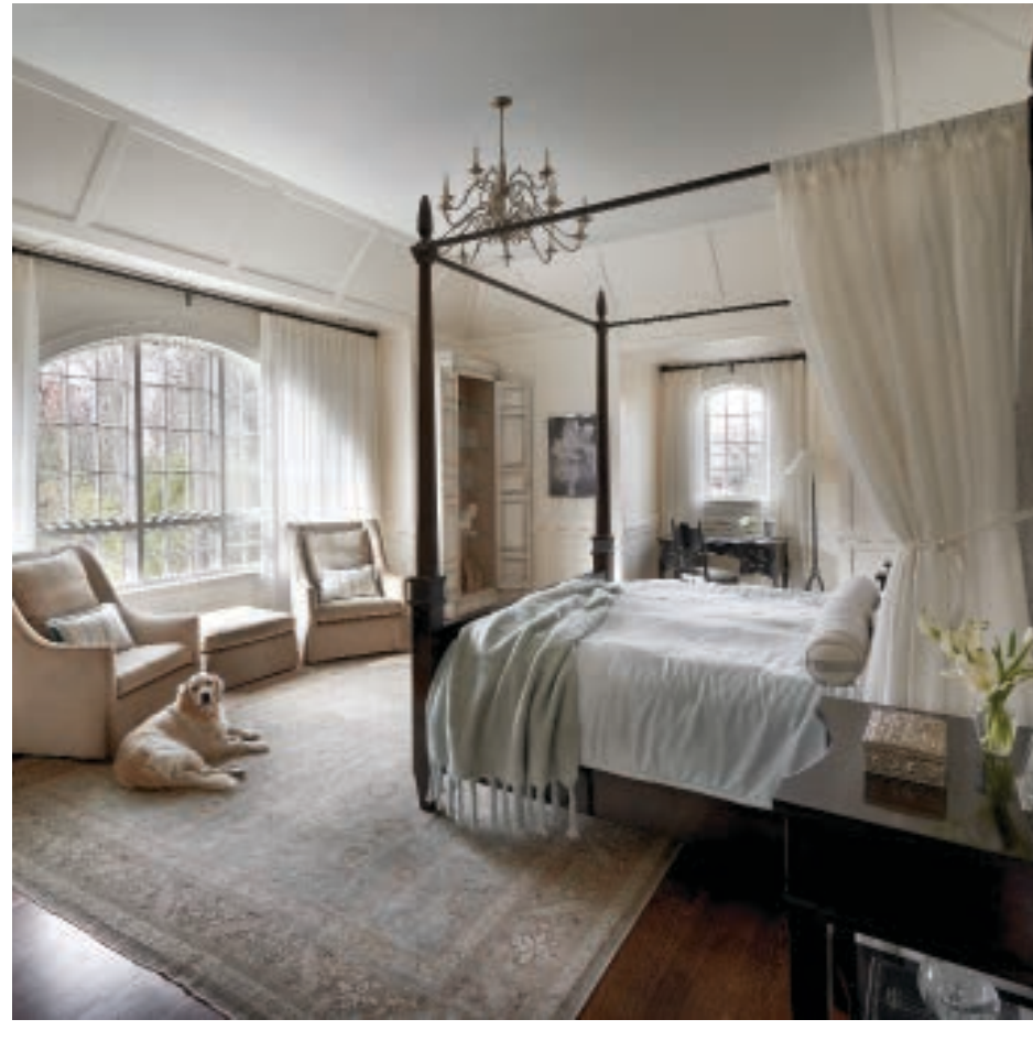
"THIS HOUSE FLOWS, BUT EVERY ROOM HAS ITS OWN UNIQUE PERSONALITY." -LAUREN COBURN

shades of blue that Coburn incorporated into the space, along with purple window treatments. "I tend to use a lot of neutrals, but my clients inspire me to use color," Coburn explains. "Those wind up being some my favorite spaces."